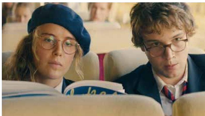
"Finsterworld" is among the German titles in this year's KINO! lineup.